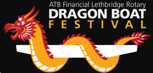
Logo Without Icon